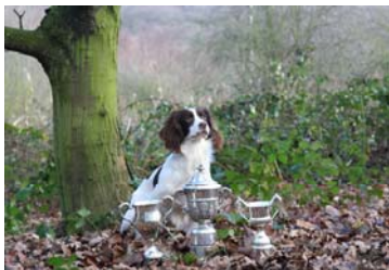
A proud Ivangar Willow!